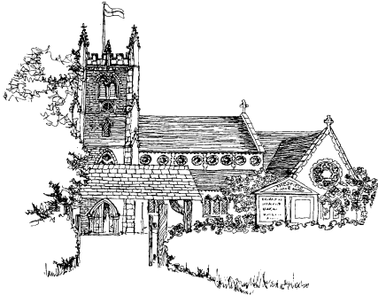
St John the Baptist Church, Church Road, Shedfield

The Ministry Team and church family of St John the Baptist Church are delighted to be involved with our Church of England Primary School.